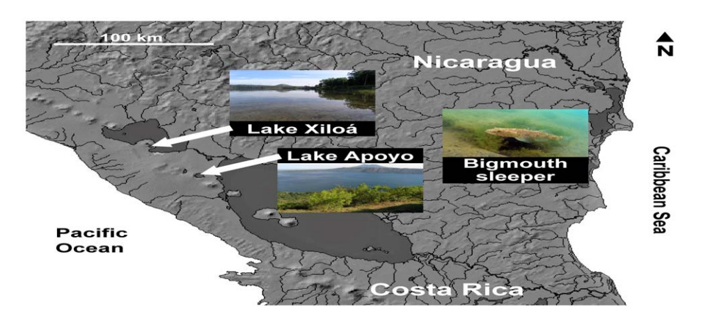
Figure 1. Lake Apoyo and Lake Xiloá. Apoyo and Xiloá are crater lakes, i.e. volcano calderas filled with water. doi:10.1371/journal.pone.0030064.g001

After a breeding territory of A. zaliosus (in Lake Apoyo, Figure 1) or A. sagittae (in Lake Xiloá, Figure 1) was located, the observer maintained a distance of approximately two metres from it. The date, water depth, horizontal visibility estimate, habitat/substratum type, and approximate total lengths of the parents and offspring were recorded. Offspring size estimations were initially based on our personal observations on the change of offspring appearance over time, and these 'age' assessments were later transformed to absolute estimations of size. The adult length estimates, in turn, were calibrated by occasionally catching