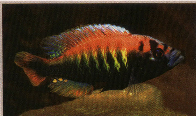
COLOR BY NATURE: Haplochromis nyererei is one of the more than 500 endemic cichlid species found in Lake Victoria, East Africa.

Although Mayr is the first to admit that Darwinian natural selection is most likely responsible for some, if not the most important, evolutionary changes that occur in an isolated population over time, he is adamant that allopatric speciation cannot be reduced to natural selection alone. “Natural selection and isolation are two different things. This would be correct even if the factor that changed things was not natural selection, but say, Lamarckian adaptation,” says Mayr. (Lamarckian adaptation, now a refuted explanation for inheritance, states that an individ-