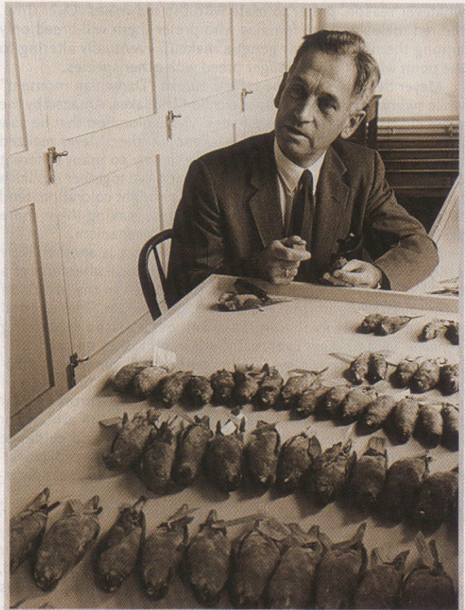
➊ ERNST MAYR and some specimens, 1961, Harvard University

"The question to whether and to what extent sympatric speciation occurs among animals is one of the most controversial subjects in the field of speciation. Unfortunately, most of the discussions of this subject have been largely speculative, and, if one attempts to gather well-substantiated data, one is surprised to find how little concrete knowledge exists."