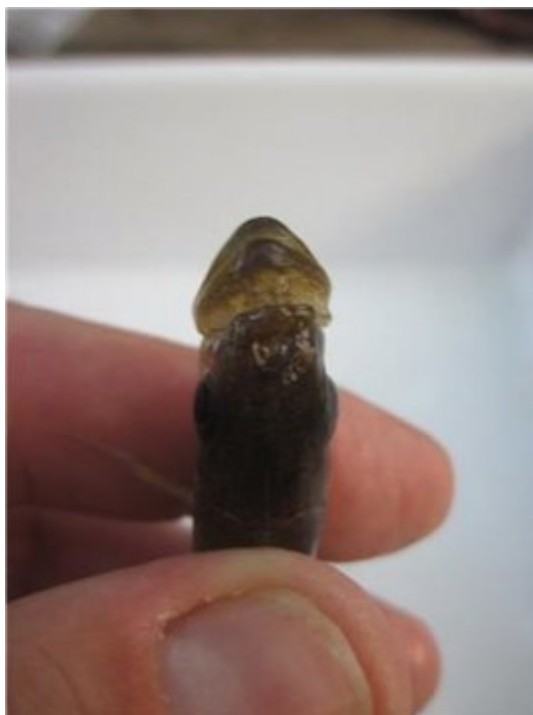
Cichlid fry with bent jaw.