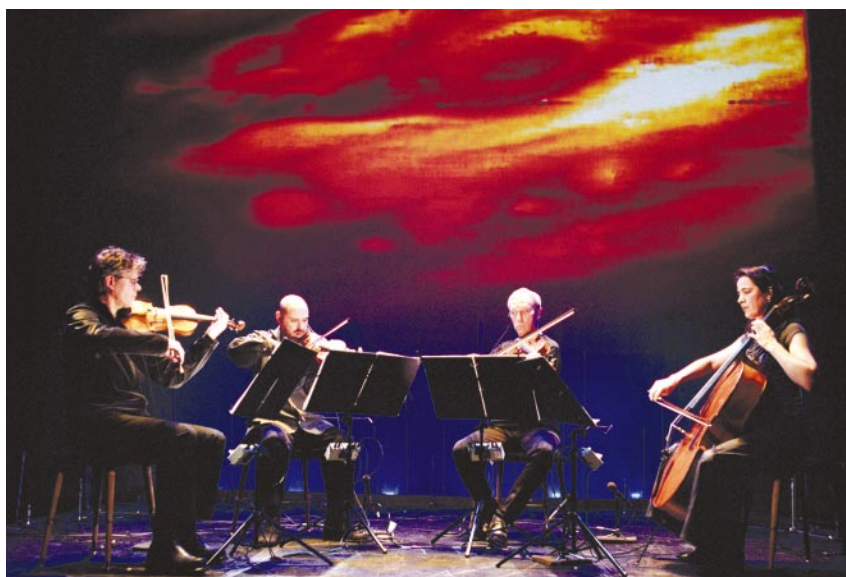
String theory? The Kronos Quartet perform Sun Rings against a backdrop of images of the Universe.

Although these often rather personal and historical sidelines might be of particular interest to science historians or researchers working on microbial genomics, these specialist readers would not want to be bothered with explanations of how the polymerase chain reaction works, for example. But such techniques and other introductory and background information will presumably be of interest to the non-specialist reader who would like to discover what genomics is all about. This kind of reader might need more explanation of some of the basic concepts in genetics and genomics, however. In some places, rather specific jargon is used which might confuse general readers. And discussion of alternative DNA-sequencing techniques is probably beyond most uninitiated readers. ‘Automatic’ sequencing techniques have been used pretty much exclusively in genomics for 15 years now, but one of the few figures in the book shows a ‘manual’ gel with radioactively labelled DNA — rather a relic of the past. The lay reader would have profited from the inclusion of